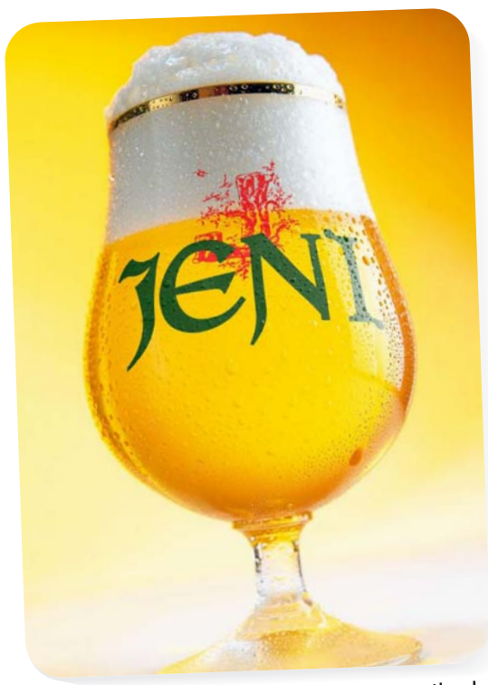
Get Your Customer's Attention!

Taking your data and merging it with a photo to create eye popping variable images for direct mail, printed materials, web pages and email messages! Choose from our library of over 1000 photos or use your own for an extra level of personalization!