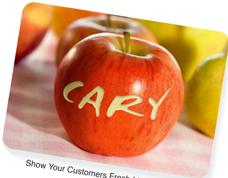
Show Your Customers Fresh Ideas!